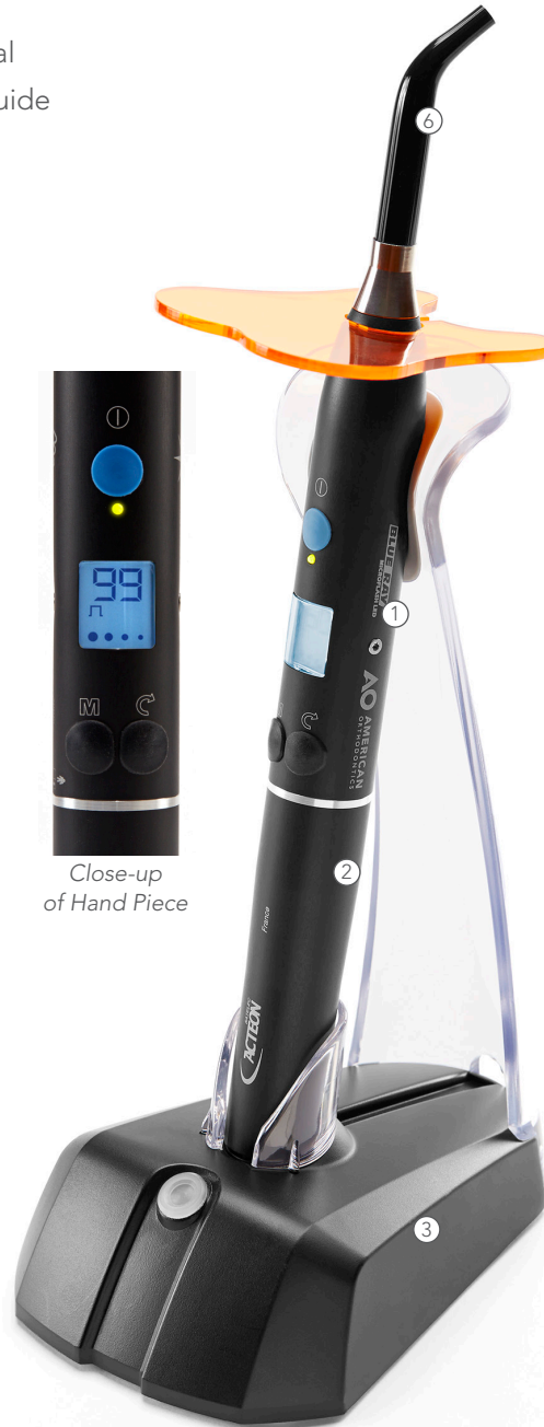
Close-up of Hand Piece